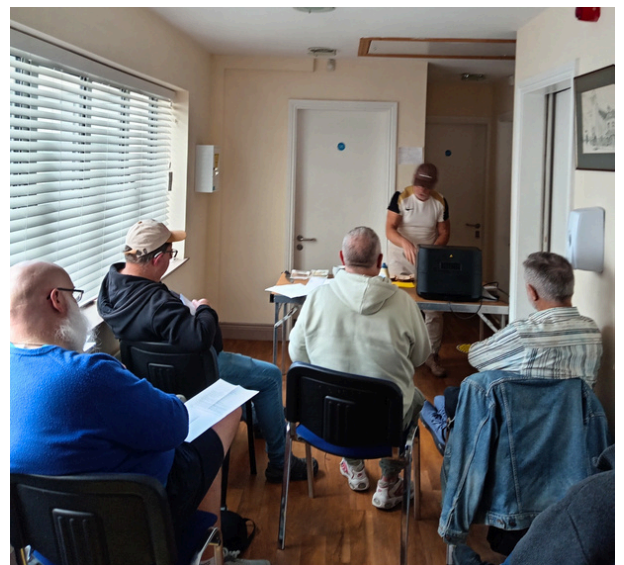
GOLDen Plates: Airfrying for Older Men with GOLD, Spet - October