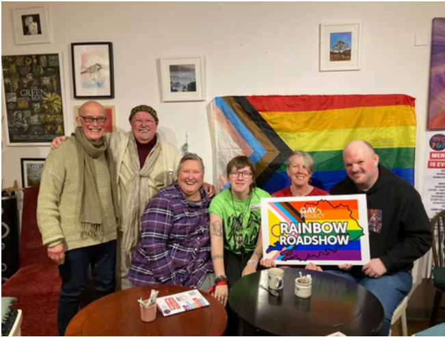
The launch of Rainbow Roadshow: Queer Vibes Bantry, 16 th October 2025

The Gay Project's Rainbow Roadshow is expanding access to LGBTI+ services across Cork County. As part of this initiative, the Gay Project, together with dedicated volunteers, is setting up LGBTI+ social cafés in local towns to create safe, welcoming, and inclusive spaces.