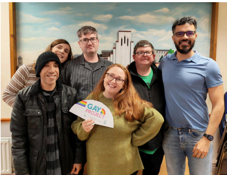
Outspoken: LGBTI+ Toastmasters

Cork Queer College, proudly supported by Cork Education & Training Board (REACH Fund 2025), with additional funding from HSE South West – Community Work Department and Cork City Council Creative Communities Fund.